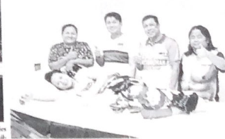
#CNI #CS #Legacy Journey #Nobles2019 #Legacy Team #MayoELM #pekkibngLingkedMamamayan #Imus #Cavite #Modern #Green #Sustainable #CityOfImus #TagCavite #CaviteGovernmentOffice #LegacyNMAK

Paghihina sa unang pagswerte sa Cavitean Section ng ating DepEd ng Imus at pagtingin sa kalagayan ng iba pang nating kababayan na nasa ating Admission Section. Hangad natin ang inyong maayos na kalusugan at agarang paggaling.