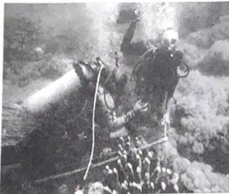
Photo: Quadrat Method (PQM) vs. Point Intercept (PI). Representation of the direct outcomes of the Filippinovation, selection of respondents, discussion of impact, and the development of protocol on determining the impact of restoration.